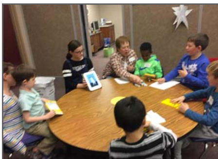
A group researches what makes the chinstrap penguin special and unique.