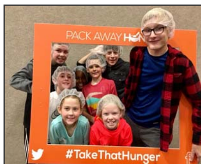
St. Andrew kids and youth participated in Pack Away Hunger. Here we are at the afternoon event.

On MLK Day, several kids and their families were able to join other members of St. Andrew at the annual Pack Away Hunger meal-packing event at Christ UMC. Between the morning and afternoon packing groups, volunteers packed over 53,000 meals to feed folks in our community and in Guatemala. What a joy that our kids have a heart for service!